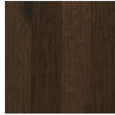
Buck Horn 5-3/4" EAS605EE