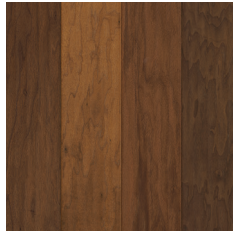
Desert Scape 5-3/4" EAS603EE