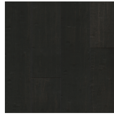
Forest Floor 5-3/4" EMAS65L04HEE