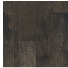
Pacific Coast 5-3/4" EHAS65L05HEE