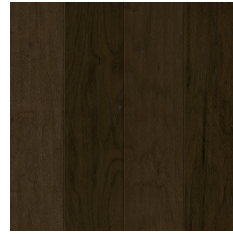
Dark of Midnight 5-3/4" EAS606EE