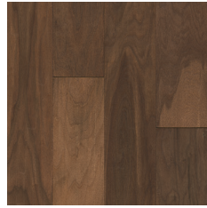
Apple Seed 5-3/4" EWAS65L02HEE