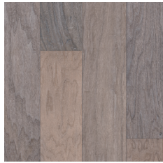
Walnut Garden 5-3/4" EAS601EE