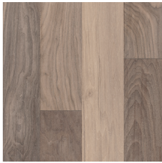
Westerly Wind 5-3/4" EWAS65L01HEE