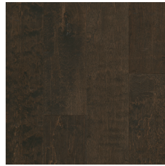
Penn's Woods 5-3/4" EBAS65L03HEE